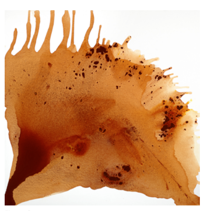
"Rustic" Acrylic On Canvas 60 x 60 Inch