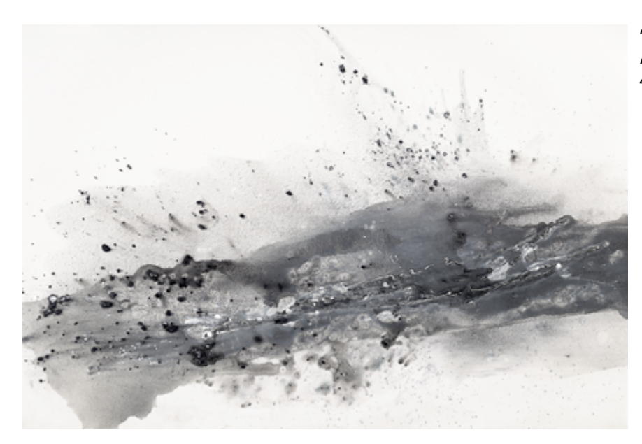
"Radiant Winter" Acrylic On Canvas 48 x 72 Inch