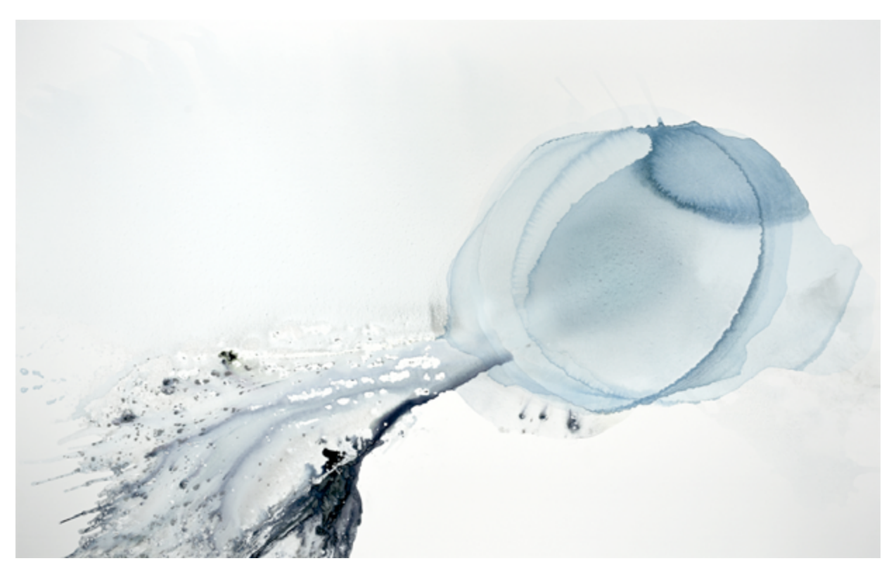
"0" Acrylic On Canvas 60 x 96 Inch