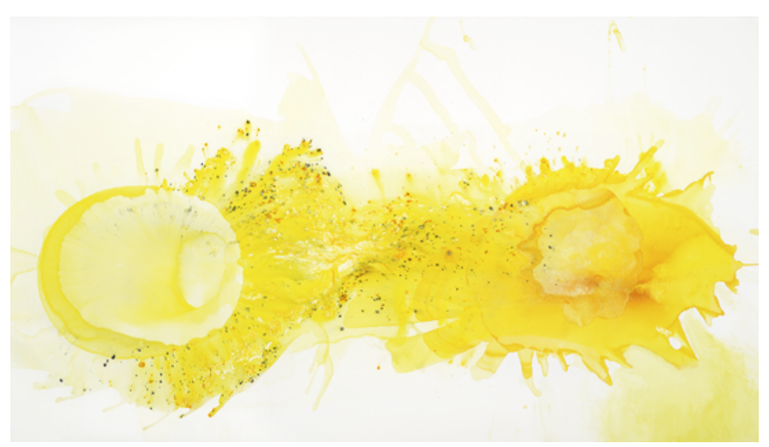
"Lemon Drops" Acrylic On Canvas 65 x 115 lnch