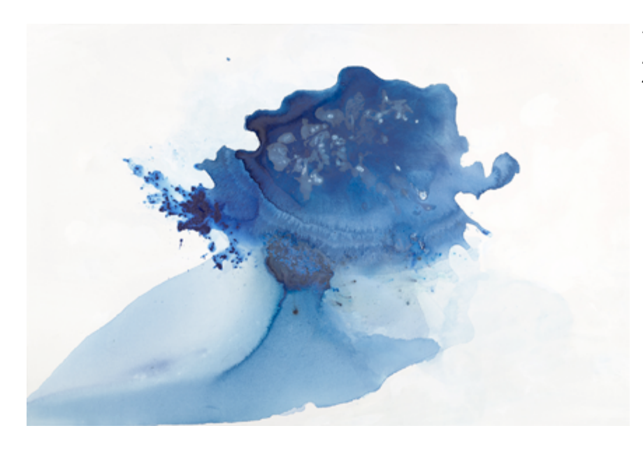
"Dreamy" Acrylic On Canvas 48 x 72 Inch