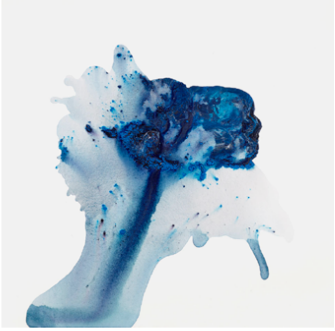
"S pring Into Blue" Acrylic On Canvas 48 x 48 Inch