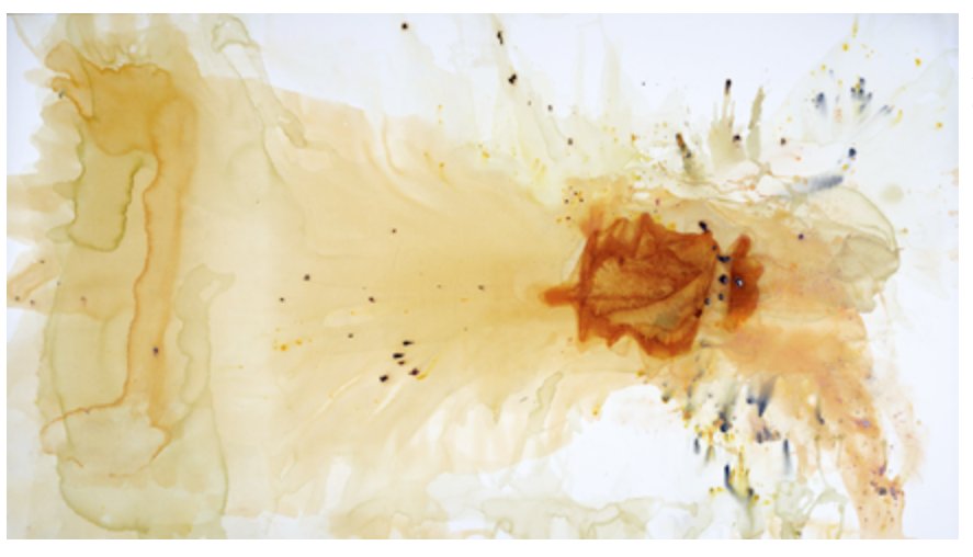
"Color Of Light" Acrylic On Canvas 63 x 115 lnch