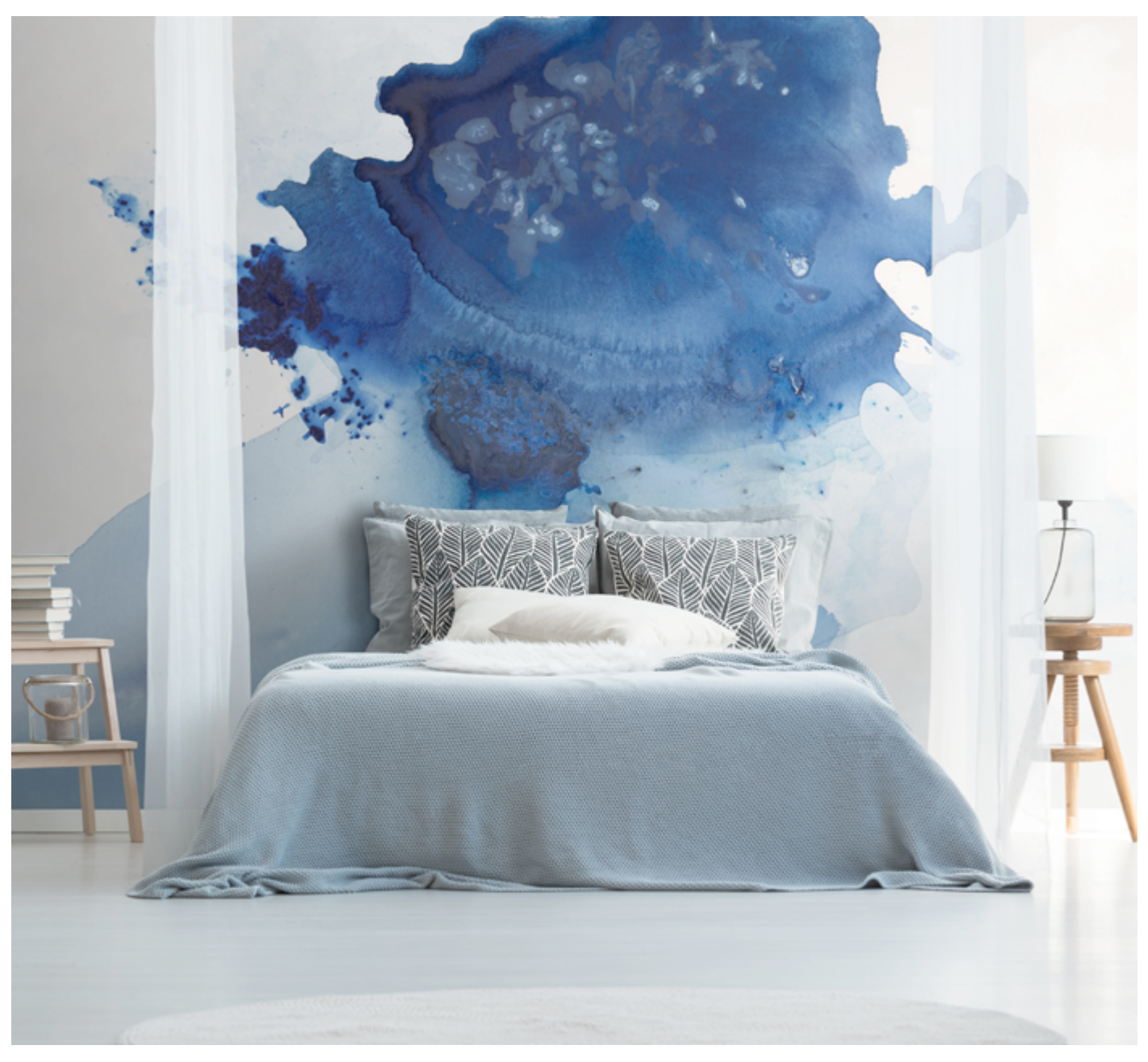
"Dreamy" Wallpaper Mural (Made To Order)