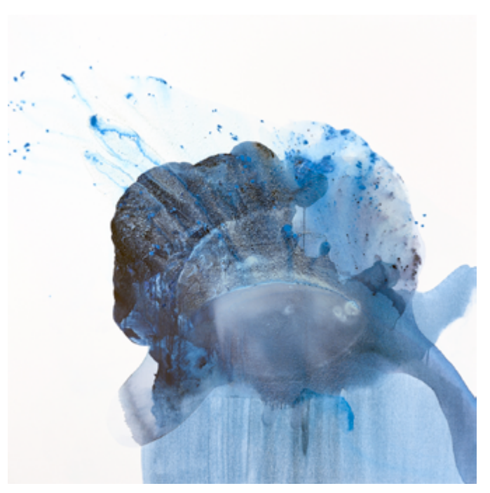
"Pearl At Sea" Acrylic On Canvas 60 x 60 Inch