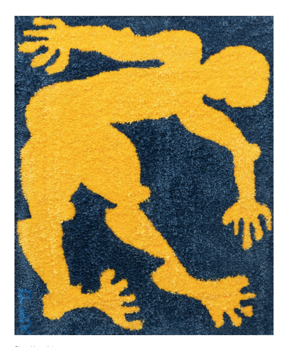
Signed by artist Acrylic yarn on polyester (framed) 77 x 63.3 cm. 30 1/4 x 24 7/8 in. (wooden frame included) (RICP/001)