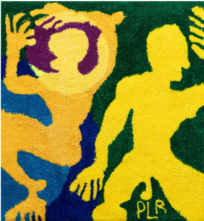
Signed by artist Acrylic yarn on polyester and paint (diptych stretched on canvas) 75 \times 140 cm. 29 1/2 \times 55 1/8 in. (over all) 75 \times 70 cm. 29 1/2 \times 27 1/2 in. (each panel) (RICP/004)