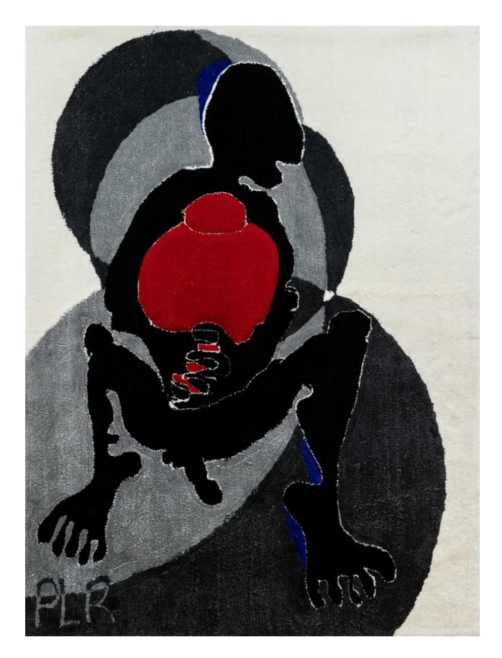
Signed by artist Acrylic yarn on polyester (unframed) 175 x 132 cm. 68 7/8 x 52 in. (RICP/007)