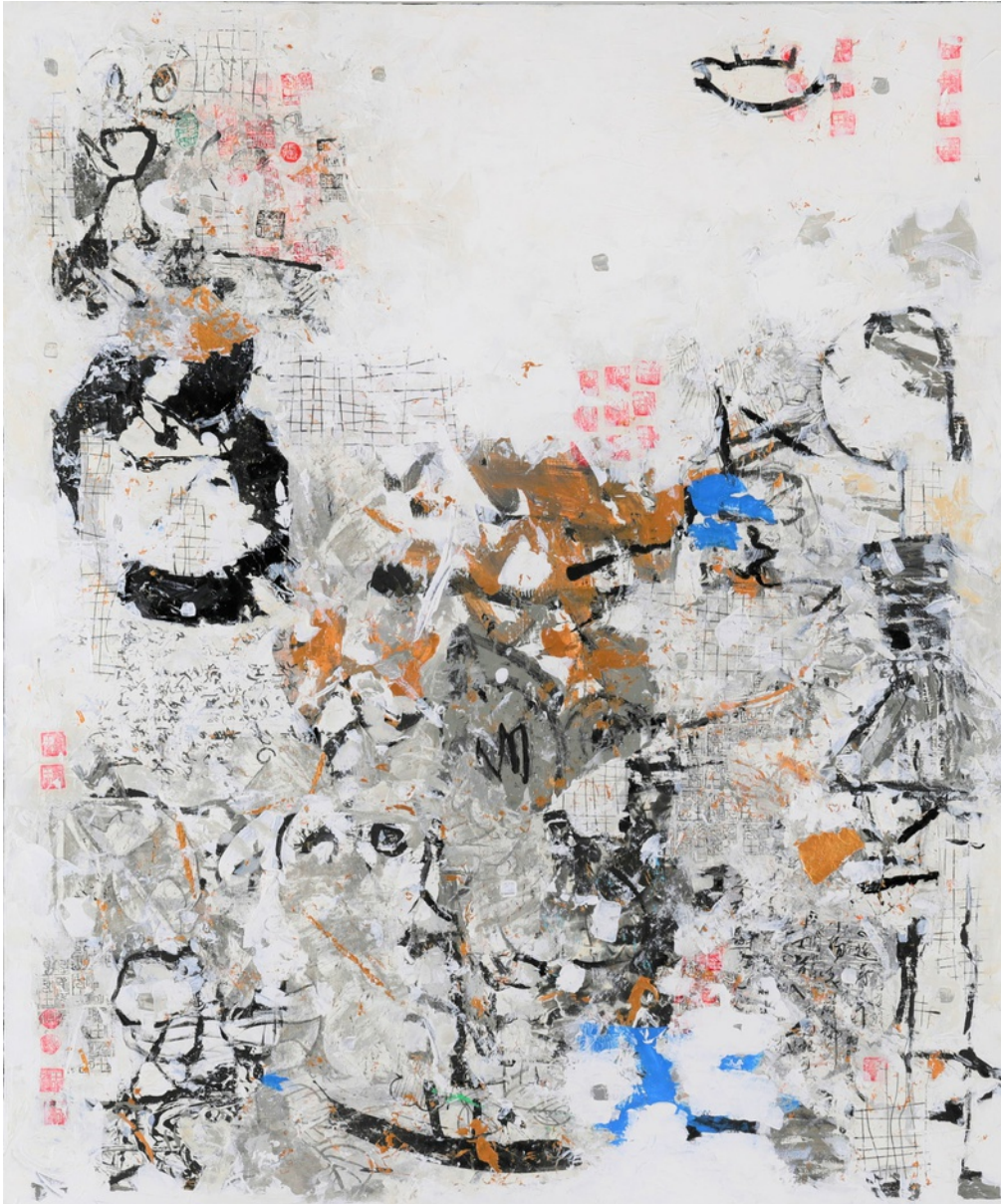
Signed and dated Rice paper, pigment, acrylic, and mixed media on canvas 120 x 100 cm. 47 1/4 x 39 3/8 in. (JAGC/013)