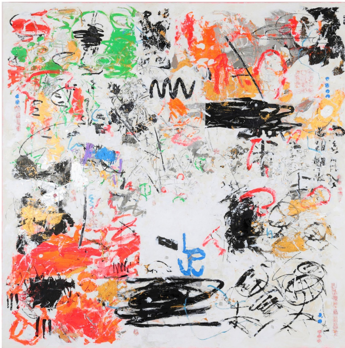
Signed and dated Rice paper, pigment, acrylic, and mixed media on canvas 180 x 180 cm. 70 7/8 x 70 7/8 in. (JAGC/008)