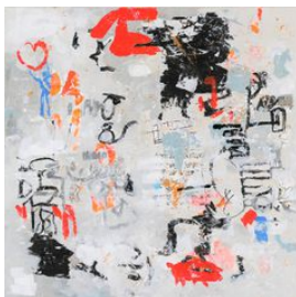
Canal Cheong Jagerroos 1968

For full details and larger images, please see the end of this document.